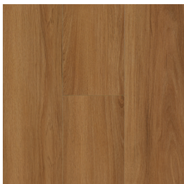
1PA67007 Vintage Charm 7.8" x 48"