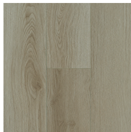
1PA67003 Washed Sepia 7.8" x 48"