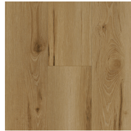
1PA67006 Sandbar 7.8" x 48"