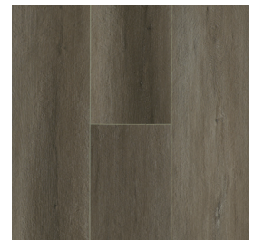
1PA67010 Stormy Night 7.8" x 48"