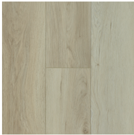
1PA67001 Sand Dune 7.8" x 48"