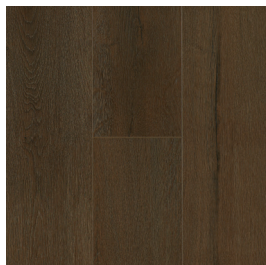
1PA67009 Dark Cocoa 7.8" x 48"