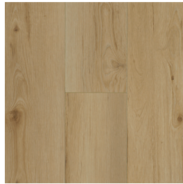
1PA67005 Natural Vista 7.8" x 48"