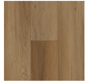
1PA67008 Kodiak Brown 7.8" x 48"