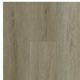
1PA67002 Pebble Beach 7.8" x 48"