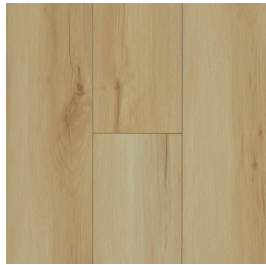
1PA67004 Honeycomb 7.8" x 48"