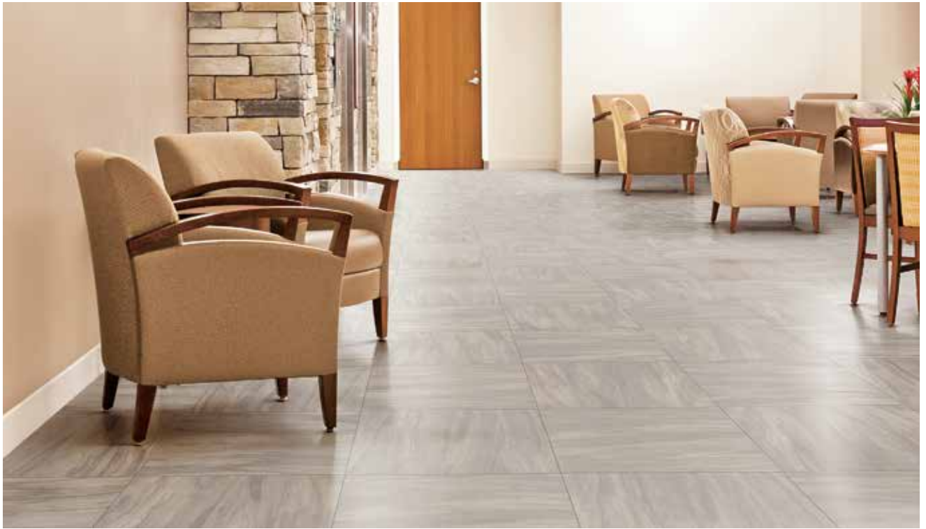
NA310 Parsa, Irish Cream