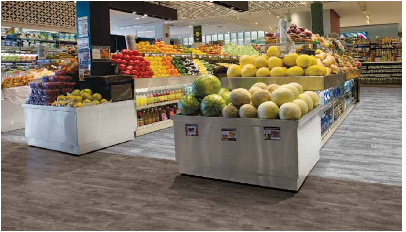
NA123 Coastal Crafted, Driftwood, NA142 City Mill, Wind Storm