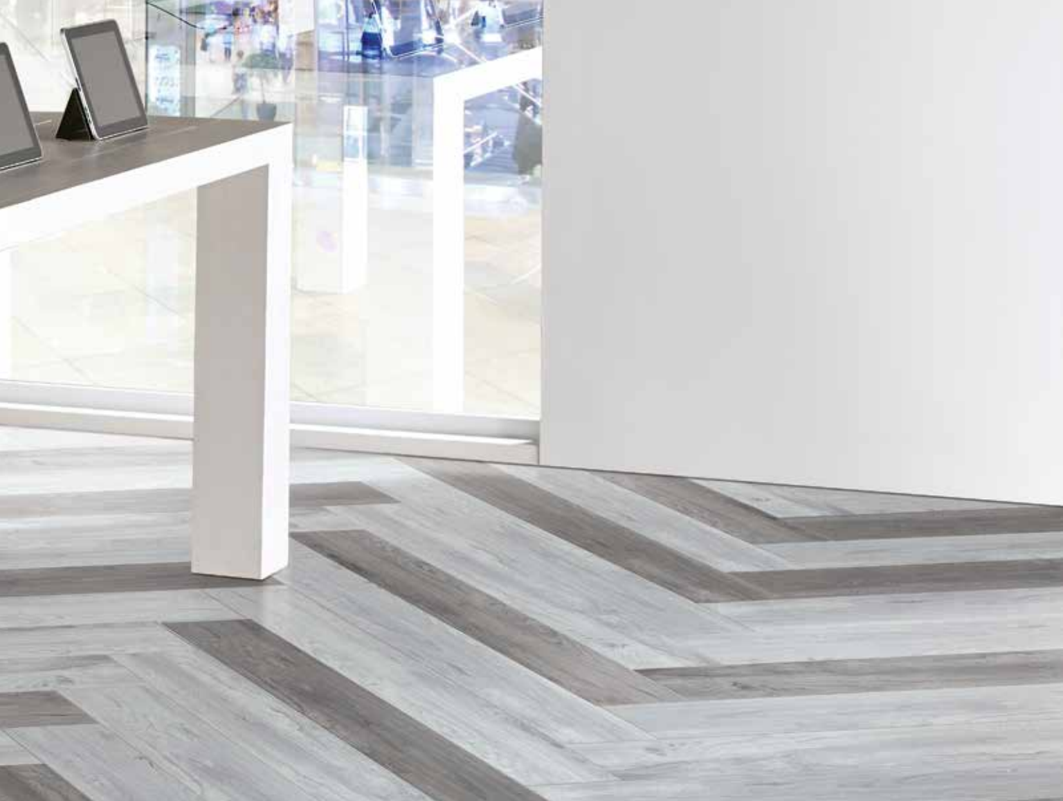
NA227 Tustin Navale, Silver Rain , NA228 Tustin Navale, Smoky Mountain