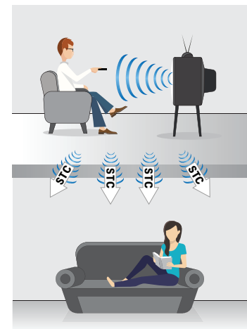
Figure 2: Structure-Borne Sound (Vibration)